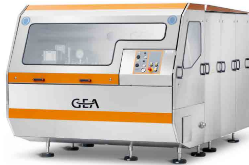
Ariete Homogenizer 5400

Ariete Series homogenizers are fully compliant with the Regulation (EC) N. 1935/2004 and all food and pharmaceutical requirements - including the most stringent certifications (USDA, FDA, CE, 3-A Sanitary Standard, Atex, cGMP).