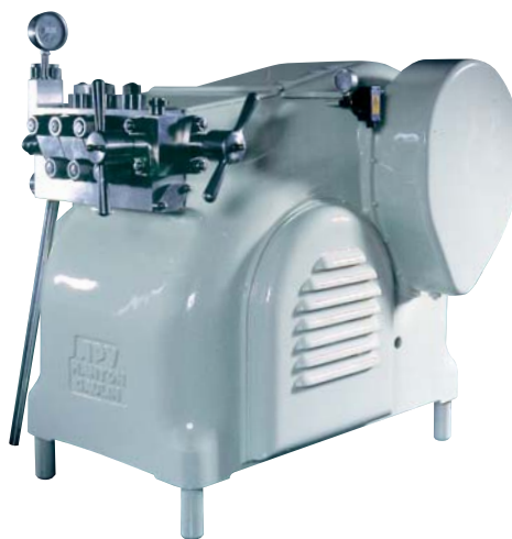
K SERIES HOMOGENISER