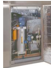
OIL AND HYDRAULIC UNITS