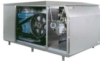
TRANSMISSION (POWER END)

We will be happy to discuss any other requirements you may have.