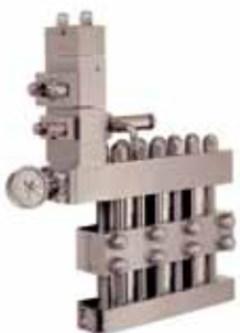
RANNIE THREE-PIECE VALVE HOUSING