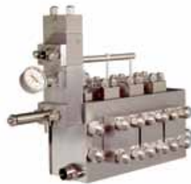
GAULIN MONO-BLOCK DESIGN