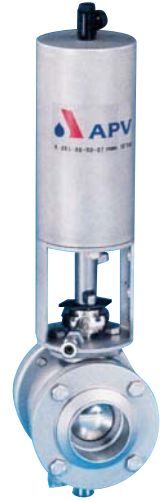
DELTA DKR 2 DOUBLE SEAL BALL VALVE DN 25-125 1+2S