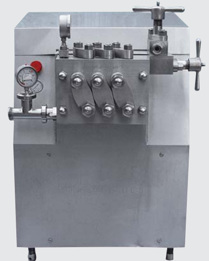
MC SERIES HOMOGENISER